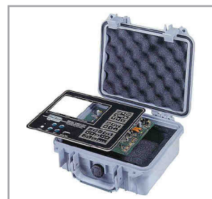
Panel Frame kit to base O-ring seal in lid