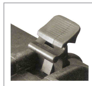
Latch - secure, easy open