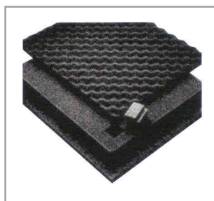
Pick-and-Pluck foam set