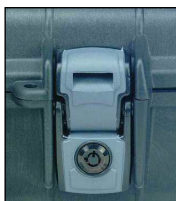
Latch - secure, easy open