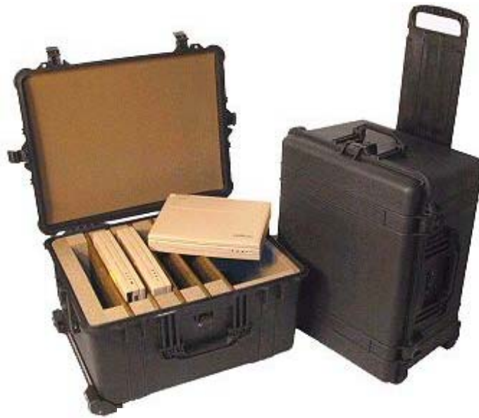
Retractable drag handle for easy handling. 1620 Peli Protector case

The rugged construction and thoughtful design combine with high quality materials to provide a case of unparalleled strength. Peli cases will even withstand the rigours of airline handling systems!