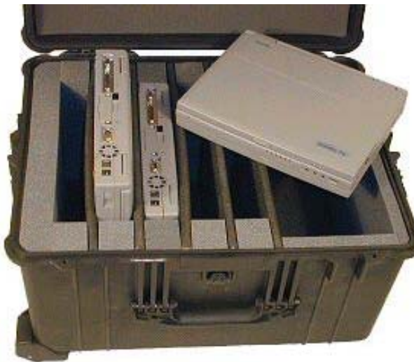
Custom made, cushioned pockets for valuable laptops

Made-to-order interior with rigid, padded divisions to suit individual requirements and provide space for cables, peripherals etc.