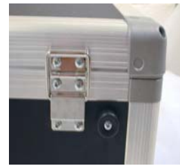
Curved edge corners

All cases supplied with natural aluminium extrusions as standard. Black powder coated extrusions and fittings available as an optional extra, please ask for details.