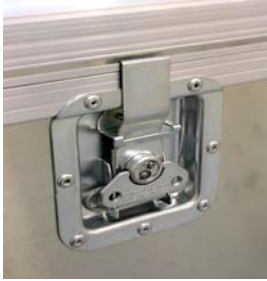
Recessed butterfly catch

All Enduro cases are made to order and can be supplied with a variety of fittings to suit individual requirements.