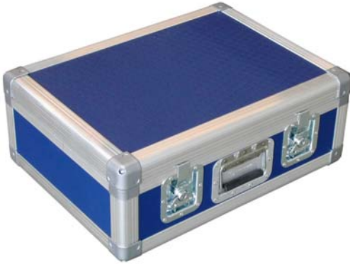
Curved edge frame

Flitebag Enduro panels are fabricated from structural aluminium honeycomb ; a material originally developed for the aerospace industry offering exceptional strength to weight performance. Enduro cases combine user-friendly curved edge frame and reinforced corners to provide highly durable cases of the highest calibre. An entirely new construction system provides high strength together with a dimensional accuracy previously not known within the traditional case making industry. An eye-catching design that stands out from more conventional flight cases.